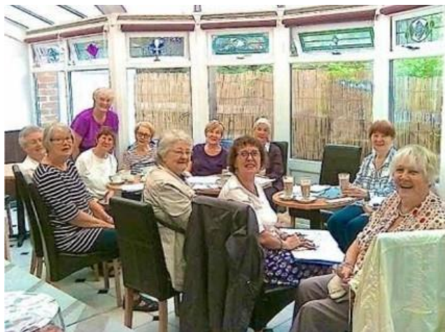
Bill's Café 2017