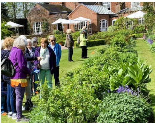
Double border at Goldstone Hall Garden

We moved on to Llandudno where we walked down to the beach, then along the promenade. We then strolled to the end of the pier inspecting all the stalls en route, followed by a lovely tea in a local cafe before heading home.