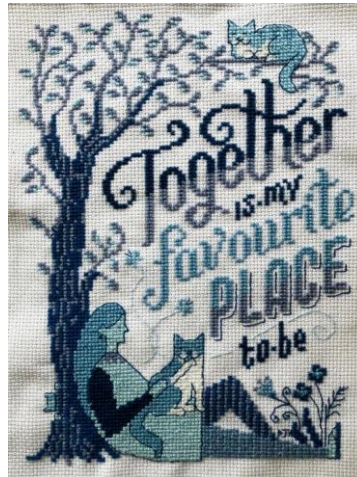
Craft group - Embroidery