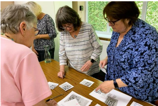
Cryptic Crossword group