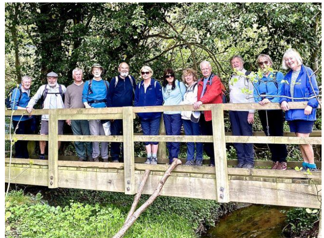
Enjoying the Dane Valley