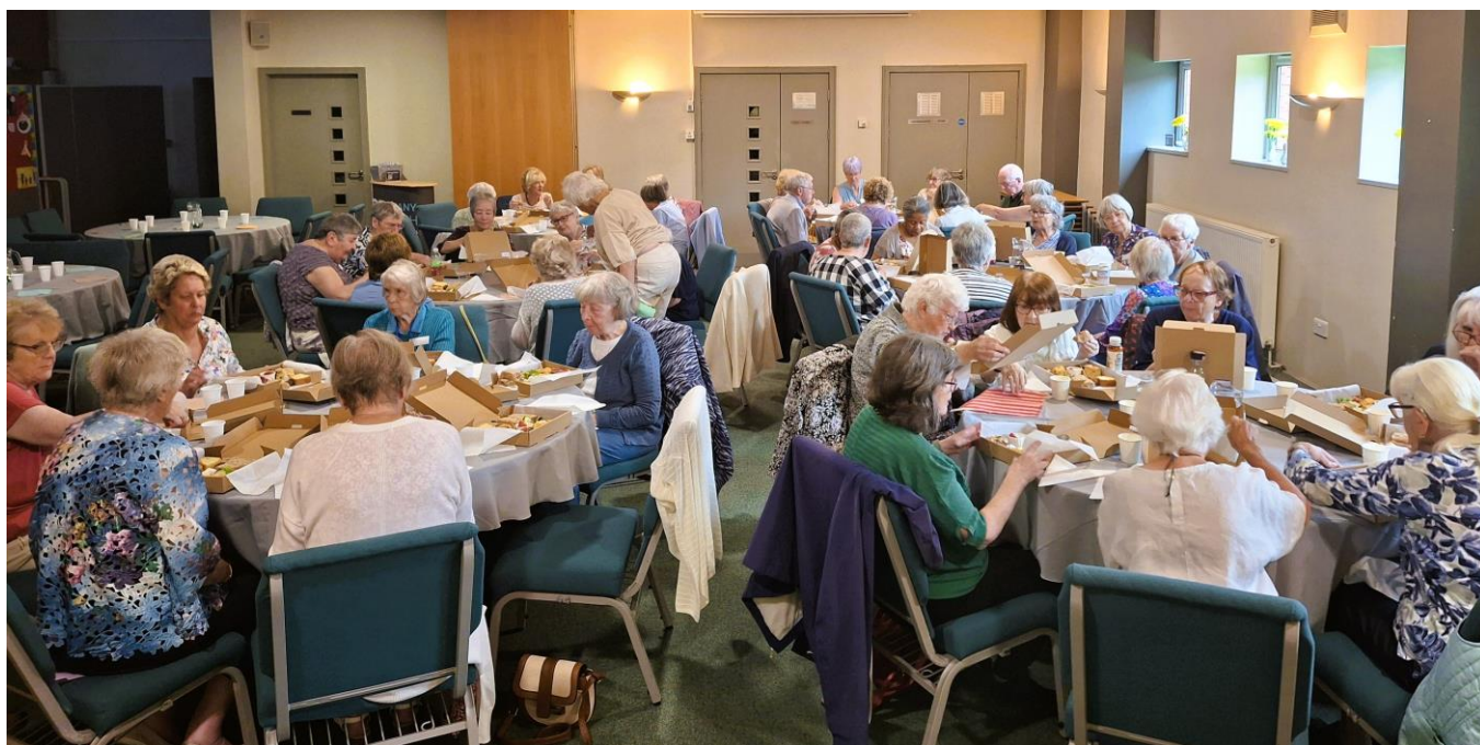
Afternoon Tea in June 2025

Many members of Explorers attended and thoroughly enjoyed the event. Well presented, tasty food with a handy box to take home leftovers and seeing the group's reactions, persuaded the convenor that Explorers should do it again next year.