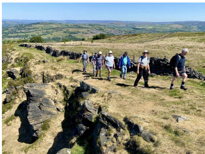
Along the Top of Black Hill Edge