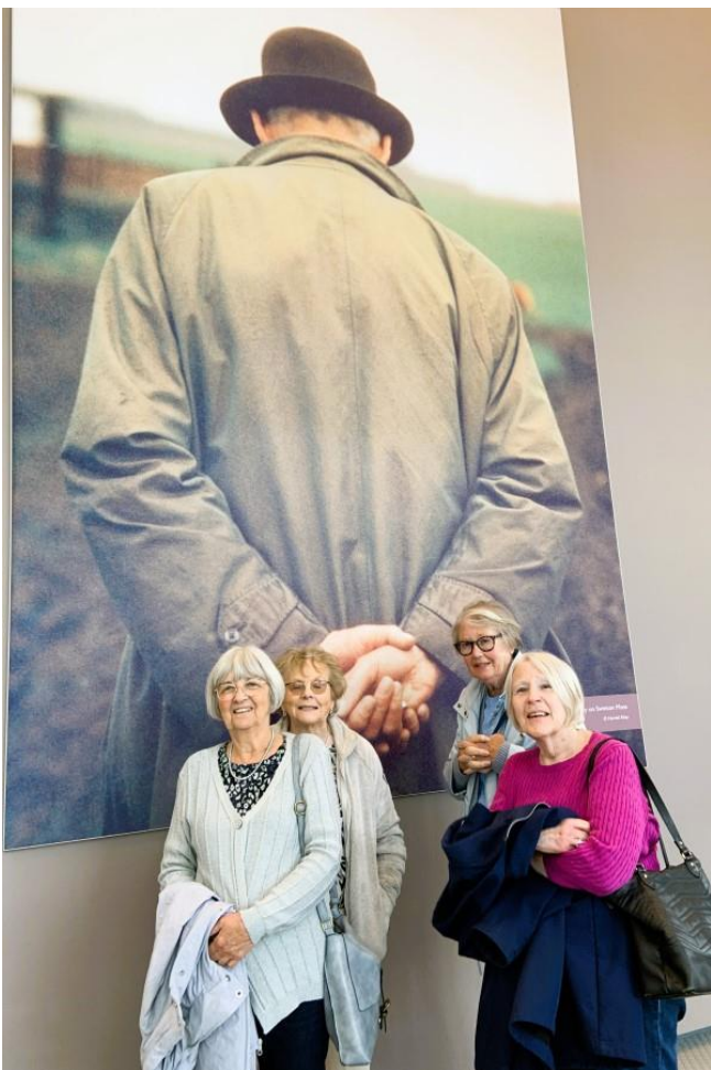
An iconic image of L.S.Lowry

In May, our destination was the “Lowry 360 Immersive” and the Modern Life Lowry Exhibition in the adjacent gallery. For 6 unique minutes, we stood amongst the animated matchstick folk ‘Going to the Match’.