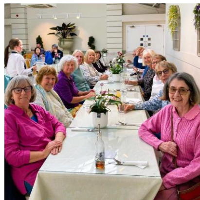
Lunch at Bridgemere Garden Centre