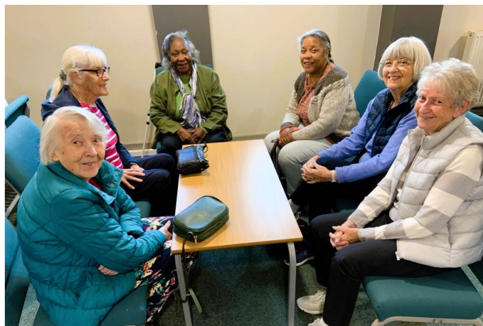
Bethany Church Lounge 2025