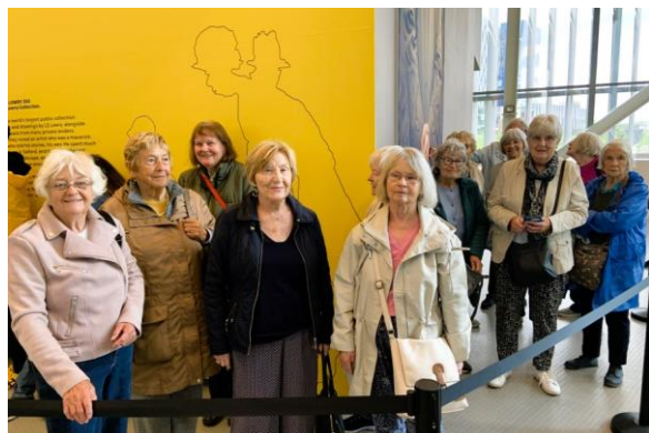
Queuing for the ‘Lowry 360 Immersive’

Our meetings are held on the last Wednesday of the month at Elm Road at 1.30pm. Everyone is welcome and no previous knowledge is required.