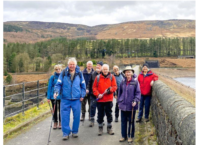
Crossing the Dam of Torside Reservoir in Longdendale