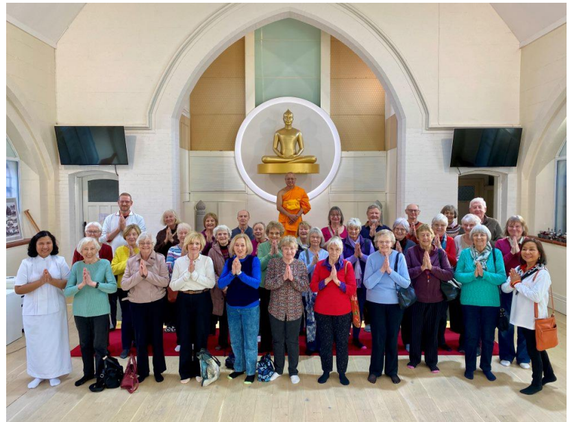
Buddhist Temple in Edgeley

We learnt about the restoration of the former church and its conversion into a temple as well as the history of Buddhism and we even enjoyed a brief meditation session. We were made most welcome and were offered soft drinks and cakes!