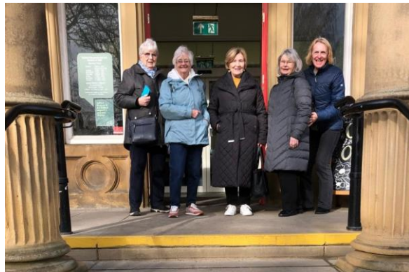
Salford Art Gallery

Afterwards we toured a Victorian Street before enjoying refreshments in the café.