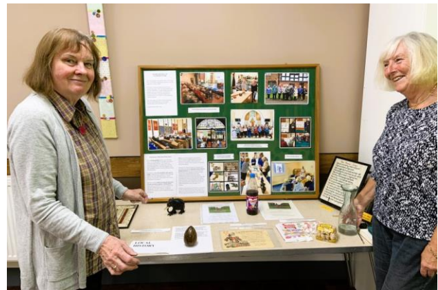
Local History group