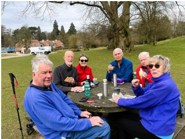
Lunch in Lyme Park