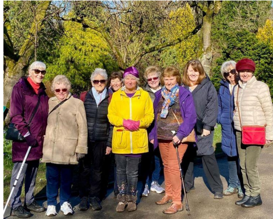
Springtime at Fletcher Moss