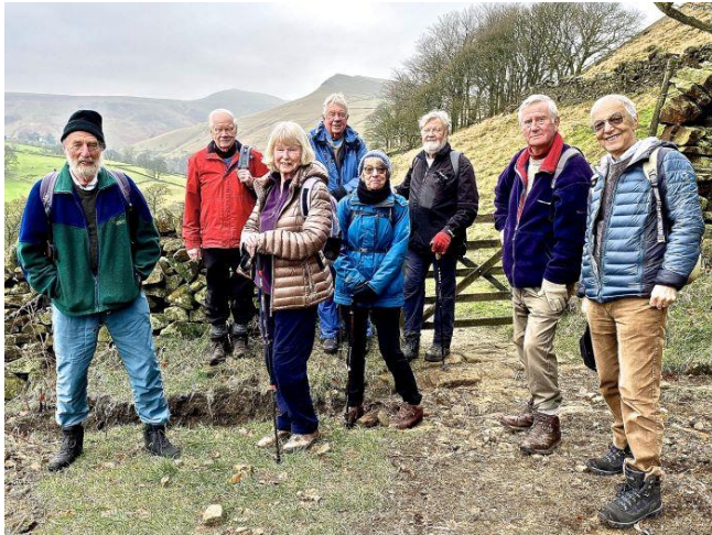
Heading towards Mount Famine