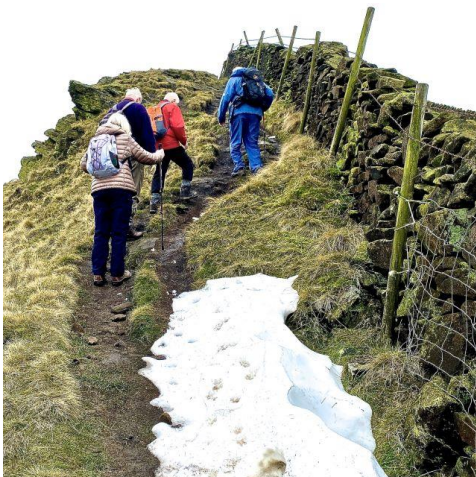
Long Walks - towards Mount Famine