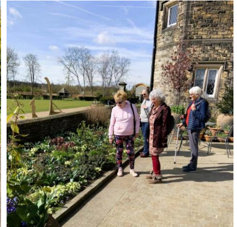
RHS Bridgewater in the Sunshine

For April's trip, we hired a minibus to visit Goldstone Hall Garden in Market Drayton which describes itself as 'the essence of a quintessential English garden set in 5 acre grounds'. Starting with refreshments on arrival, we had a brief introduction from our guide and were then encouraged to wander through the walled garden with its double tiered herbaceous borders and then on into the extensive kitchen garden that supplies the hotel with fruit and vegetables - a highlight being the apple trees in full blossom.