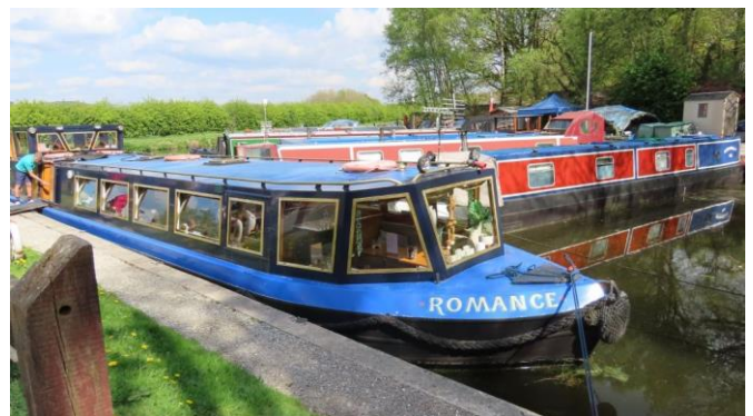
Leeds & Liverpool Canal