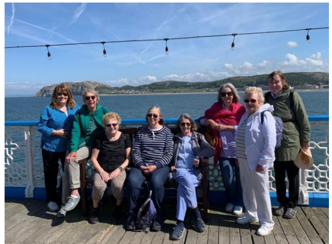
Gardening group at Llandudno