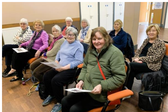
Monthly Meeting in March

Our meetings are held on the last Wednesday of the month at Elm Road at 1.30pm. Everyone is welcome and no previous knowledge is required.