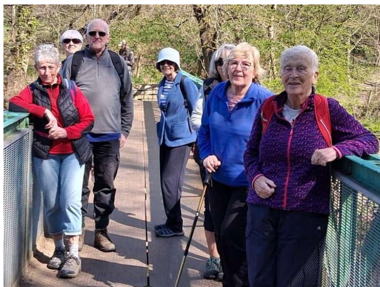
Short Walking group in Goyt Valley