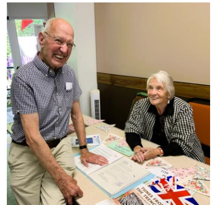
Singing For Pleasure group