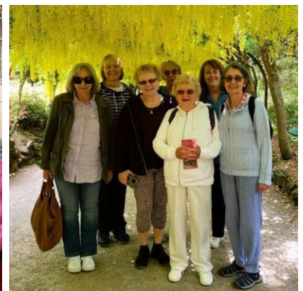
Laburnum Arch - Bodnant Gardens