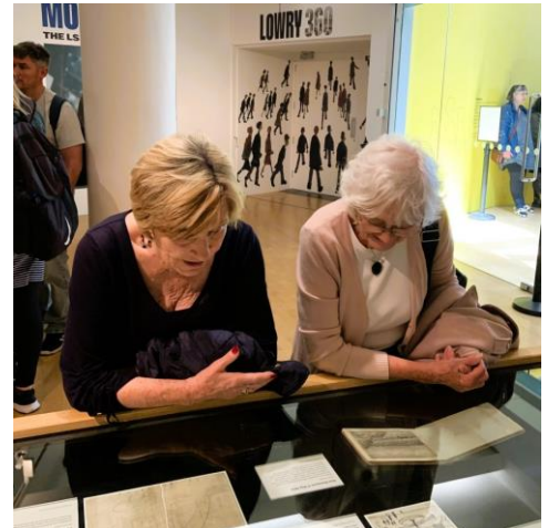
History of Art group at the Lowry Gallery