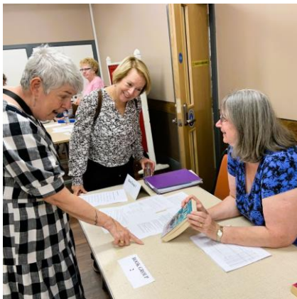
Book group 2