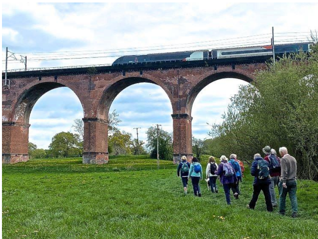
The Twemlow (Harry Styles) Railway Viaduct