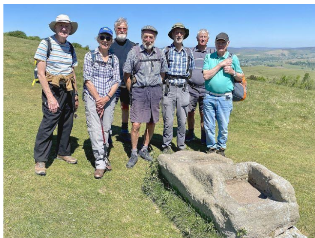
At the Dipping Stone